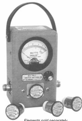
Elements sold separately.

The 4410A high-sensitivity wattmeter is a solid choice for field-service applications where the greater dynamic range of the plug-in elements substantially reduce the number of elements needed to cover multiple power and frequency ranges. It is also well-suited to laboratory work where power levels as low as 2 milliwatts must be measured with high accuracy.